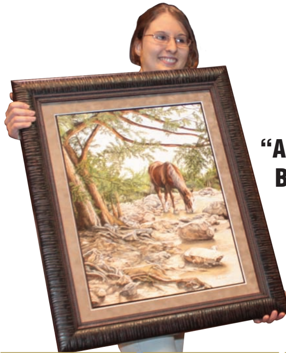
"A PIECE OF HEAVEN" BY: CHRISTY BELTZ